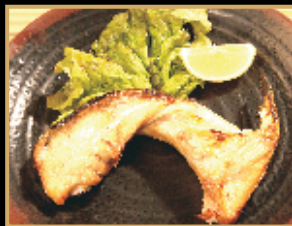
Hamachi Kama $14.95