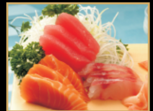
Sashimi Appetizer Tuna 3pcs Salmon 2pcs Yellowtail 3pcs $18.95