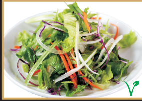
House Salad $4.95