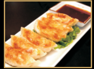
Gyoza Steamed or Deep Fried $7.50