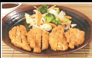
Chicken Katsu Deep fried chicken tender served with steamed vegetable $ 20.95

These items may contain raw or undercooked ingredients, may be cooked to order. Consuming raw or undercooked meats, poultry, seafood, shellfish or eggs may increase your risk of food-borne illness. Crabmeat means imitation crabmeat. Image may appear different than actual item.