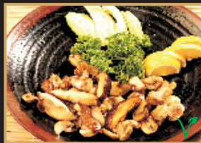
Mushroom & Avocado Salad Stir fried mushroom with avocado $10.95