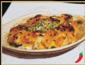
Dynamite Chopped tako, scallop, shrimp, onion, mushroom with spicy mayonnaise $10.95