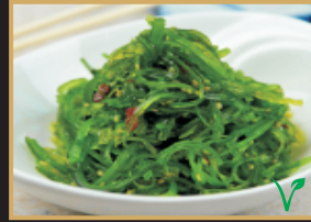
Seaweed Salad $7.95