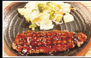
N.Y. Steak Teriyaki 10 oz. USDA choice NY steak with Kyoto's own teriyaki sauce $ 24.95