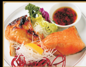
Salmon Kama $14.95