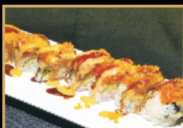
Sunset Roll in: crabmeat, cucumber, avocado top: deep fried fresh water eel, spicy tuna, masago with spicy & sweet sauce $19.95