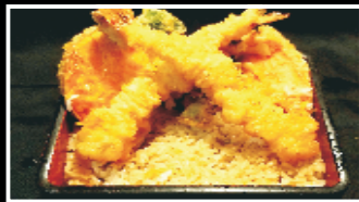
Ten Ju Shrimp & vegetable tempura, served on steamed rice $ 17.95