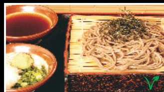
Zaru Soba Cold buckwheat noodles, served with Kyoto's own special cold soba sauce $ 16.95