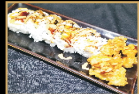
Lobster Roll deep fried baby lobster, crabmeat, avocado with spicy & sweet sauce $17.95