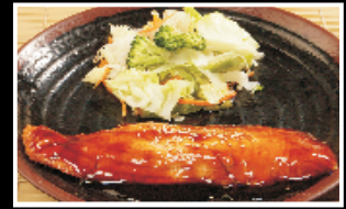
Salmon Teriyaki Delectable filet of salmon, broiled, served with Kyoto's own teriyaki sauce $ 23.95