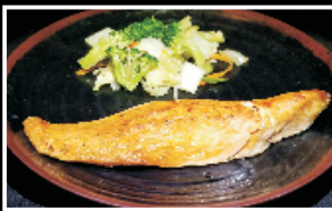
Broiled Salmon Steak Delectable filet of salmon, broiled with lemon butter $ 23.95