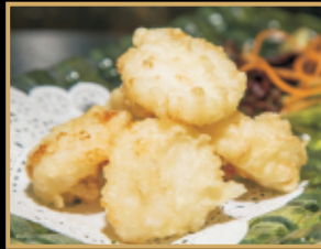
Scallop Tempura $10.95