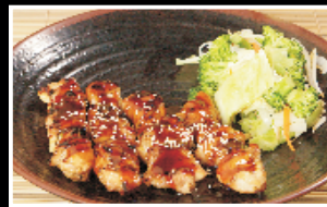
Yakitori Marinated chicken leg with Kyoto's own teriyaki sauce, cooked on skewers $ 18.95