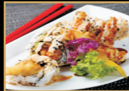
Kyoto Roll crab, tamago, gobo, cucumber shrimp tempura, bean sprouts with sweet sauce $14.95