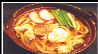
Oyako Udon or Soba Noodles, chicken tender, egg in broth $ 17.95