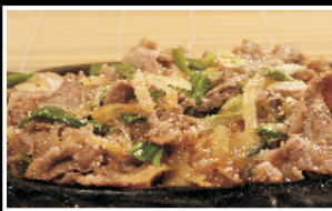
Yaki Niku Grilled thin sliced beef, marinated in Kyoto's special sauce $ 22.95