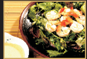
Shrimp Salad Boiled shrimp with spring mix salad $10.95