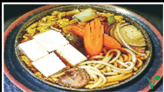
Vegetable Sukiyaki Napa, green onion, carrot, tofu, yam noodles, udon noodles served in cooking vessel $ 21.95