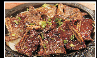
Beef Short Ribs (Korean BBQ) Grilled sliced beef ribs marinated in Kyoto's special sauce $ 30.95