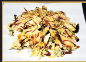
Omega 3 Salad deep fried salmon with seaweed, deep fried asparagus served on green salad eel sauce & spicy mayo sauce $14.95