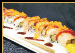
Yuki Deluxe Roll in: shrimp tempura, cucumber top: tuna, salmon, yellowtail, white fish with sweet sauce & masago $16.95