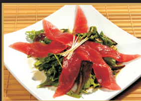
Maguro Salad Thin sliced tuna with spring mix salad $17.95