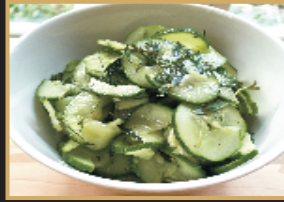
Sunomono Salad With choice of shrimp or crab $6.95