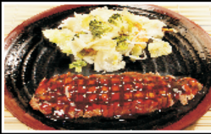
Top Sirloin Teriyaki 10 oz. USDA prime top sirloin with Kyoto's own teriyaki sauce $ 21.95