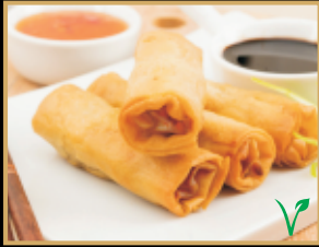
Egg Roll $6.95