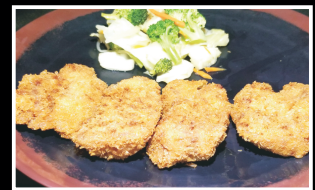
Ton Katsu Deep fried pork tender loin cutlet, served with steamed vegetable $ 20.95