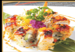
Fire Roll (baked) in: crabmeat, cucumber, avocado top: baked salmon with spicy & sweet sauce $16.95