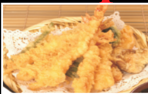
Combination Tempura Shrimp and vegetable tempura, scallop, white fish, calamari $ 23.95