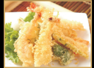
Shrimp & Vegetable Tempura $9.95