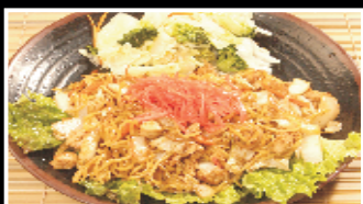
Yakisoba Stir fried noodles with one of the choice below ✓ Vegetable $15.95 Chicken $16.95 Beef $17.95 Shrimp $18.95

These items may contain raw or undercooked ingredients, may be cooked to order. Consuming raw or undercooked meats, poultry, seafood, shellfish or eggs may increase your risk of food-borne illness. Crabmeat means imitation crabmeat. Image may appear different than actual item.