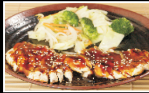
Chicken Teriyaki Chicken breast with Kyoto's own teriyaki sauce $ 21.95