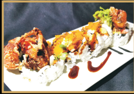
Spider Roll in: soft shell crab, tamago, gobo, cucumber, bean sprout, crab top: masago with sweet sauce $17.95