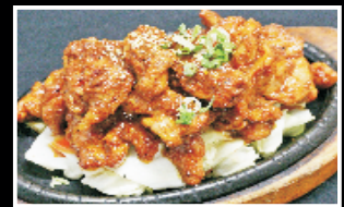
Spicy Chicken Grilled marinated chicken with special spicy sauce $ 19.95