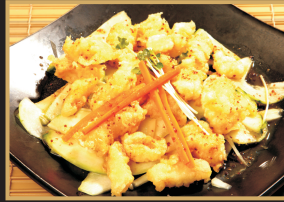
Calamari Salad $12.95