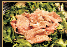
Shabu Shabu Salad Thin sliced beef, dipped in hot broth with spring mix salad $10.95