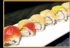
Rainbow Roll in: crabmeat, cucumber, avocado top: 4 kinds fish, cooked shrimp avocado $17.95