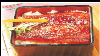
Una Ju Broiled fresh water eel, served on steamed rice $ 23.95