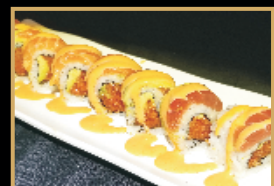
911 Roll in: spicy tuna, avocado top: tuna, salmon, avocado, spicy mayo $17.95