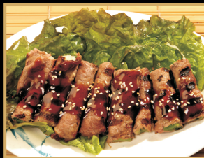
Negi Maki Grilled thin sliced beef with green onion $9.25