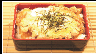
Oyako Ju Chicken tender, onion, egg, served on steamed rice $ 17.95