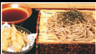
Ten Zaru Cold buckwheat noodles with shrimp & vegetable tempura $ 18.95