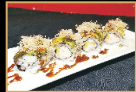
Caterpillar Roll in: crabmeat, cucumber, avocado top: fresh water eel, avocado, fish flake with sweet sauce $16.95