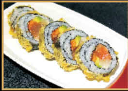
San Roque Roll tuna, salmon, yellowtail, gobo, masago, avocado inside and deep fried, spicy sauce side $16.95