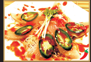
Spicy Albacore Salad Albacore sashimi, jalapeno, radish, spicy & ponzu sauce $17.95