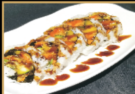
Tempura Roll deep fried salmon, white fish, vegetable, cucumber, gobo, bean sprouts with sweet sauce $14.95