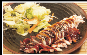
Baked Stuffed Squid Crabmeat inside squid served with Kyoto's own teriyaki sauce $ 22.95