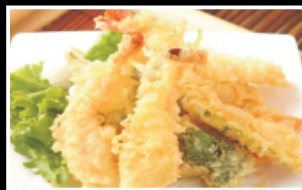
Shrimp Tempura Shrimp & vegetable tempura served with Kyoto's own special sauce $ 21.95