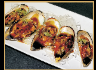
Baked Green Mussels $10.50