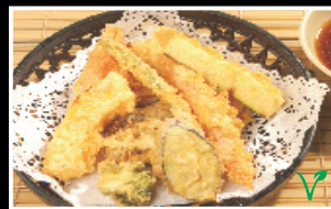
Vegetable Tempura Mushroom, zucchini, eggplant, yam, carrot, long bean, banana squash $ 19.95