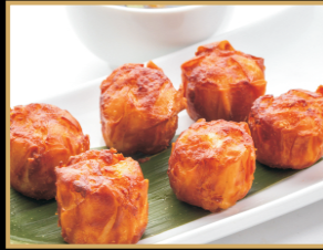
Shumai Steamed or Deep Fried $6.95