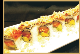
Hawaiian Roll in: salmon, yellowtail, avocado top: fresh water eel, macadamia nuts with sweet sauce $17.95