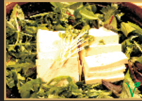
Tofu Salad $7.95