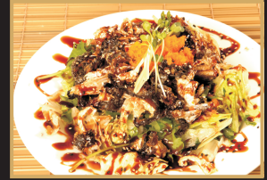
Salmon Skin Salad $10.95