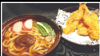
Tempura Udon or Soba Noodles, shrimp & vegetable tempura side $ 17.95