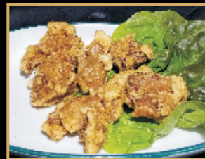
Tatsuda Age Deep fried lemon chicken $6.95