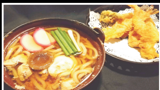
Nabeyaki Udon or Soba Noodles, egg, chicken tender in broth, shrimp & vegetable tempura side $ 18.95