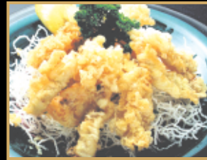
Calamari Tempura $10.95