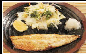
Saba Shioyaki Broiled salt mackerel $ 17.95