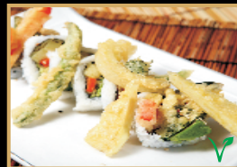
Vegetable Tempura Roll deep fried sweet potato, carrot, zucchini, eggplant, cucumber, gobo $14.95