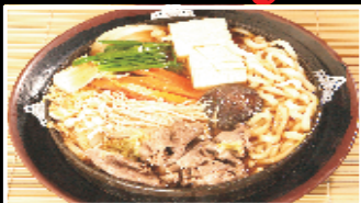
Beef Sukiyaki Thin sliced beef, tofu, yam noodles, udon noodles, vegetable served in cooking vessel $ 24.95