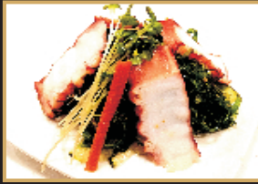
Octopus Salad $8.95