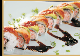
Snake Roll in: crabmeat, cucumber, avocado, top: fresh water eel, avocado, with sweet sauce $16.95