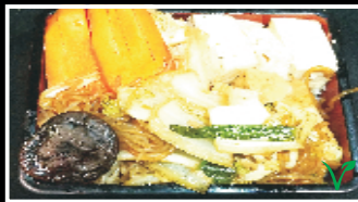
Tofu Ju Tofu, vegetable with Kyoto's special sauce, served on steamed rice $ 16.95