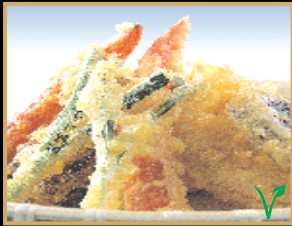
Vegetable Tempura $8.95