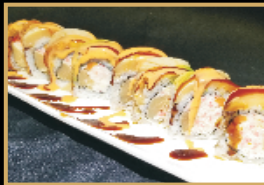
Double Albacore Roll in: crabmeat, albacore, gobo top: albacore, avocado with ponzu, spicy & sweet sauce $16.95