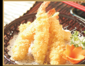
Shrimp Tempura $10.50