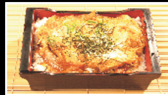
Katsu Ju Chicken tender or pork loin cutlet, onion, egg, served on steamed rice $ 17.95