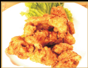
Sesame Chicken $6.95