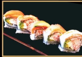
Philadelphia Roll in: crabmeat, cucumber, avocado, cream cheese top: smoked salmon, avocado, cooked shrimp $15.95