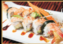
Tiger Roll in: crabmeat, shrimp tempura top: cooked shrimp with special sauce $16.95