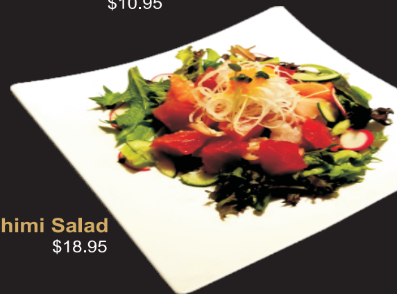
Mixed Sashimi Salad $18.95