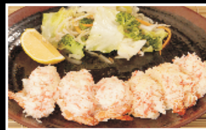
Baked Stuffed Shrimp Crabmeat with shrimp with lemon butter $ 22.95