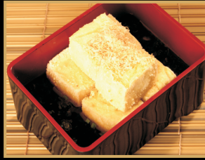
Agedashi Tofu $7.95