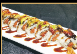
Energy Roll in: Shrimp tempura, cucumber, spicy tuna top: eel, Avocado & sweet sauce $17.95