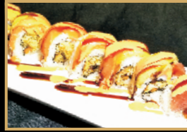
Tear Roll in: fresh water eel, gobo tempura crunch top: tuna, salmon, avocado with spicy & sweet sauce $17.95