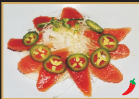
Leo's Salad Daicon, tuna, jalapeno & spicy ponzu sauce $17.95