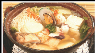
Yosenabe Combination seafood soup-shrimp, crab, scallop, salmon, green mussel, octopus with vegetable, tofu, yam noodles. Udon noodles prepared in special fish broth, $ 25.95