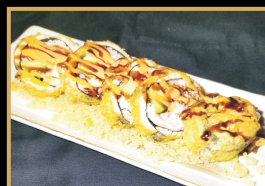
Salmon Crunch Roll deep fried salmon, crabmeat, gobo, avocado, crunch with spicy & sweet sauce (no rice) $16.95