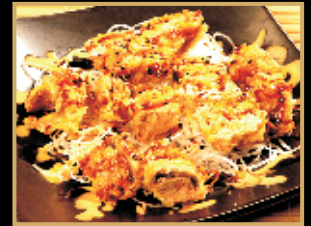
Eye Ball Deep fried mushroom, spicy tuna, with spicy & sweet sauce $10.95