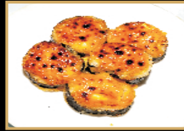
Volcano Roll (baked) tuna, salmon, yellowtail, white fish, masago, cream cheese, baked with spicy sauce $16.95