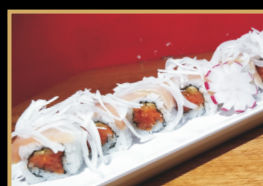
Albacore Delight Roll in: cucumber, spicy tuna top: albacore, spicy ponzu, yellow onion $17.95

These items may contain raw or undercooked ingredients, may be cooked to order. Consuming raw or undercooked meats, poultry, seafood, shellfish or eggs may increase your risk of food-borne illness. Crabmeat means imitation crabmeat. Image may appear different than actual item.